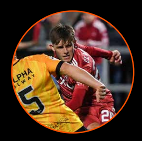
vs Annan Athletic