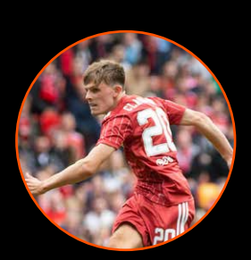
vs St Mirren