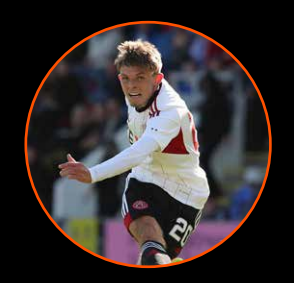
vs St Johnstone