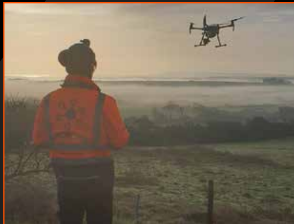
Survey of trunk mains via drone for leak investigation