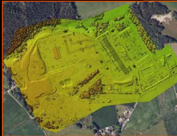
3D Capture & Inspection of Kintore Substation development