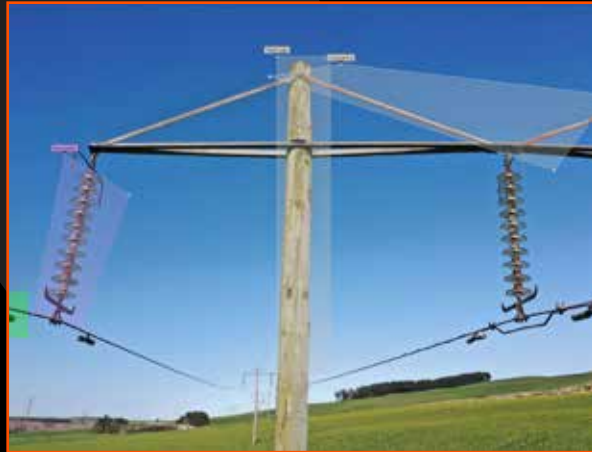
FB Circuit Inspection