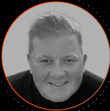
IN THE FIELD