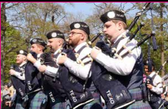
DEESIDE CALEDONIA PIPE BAND