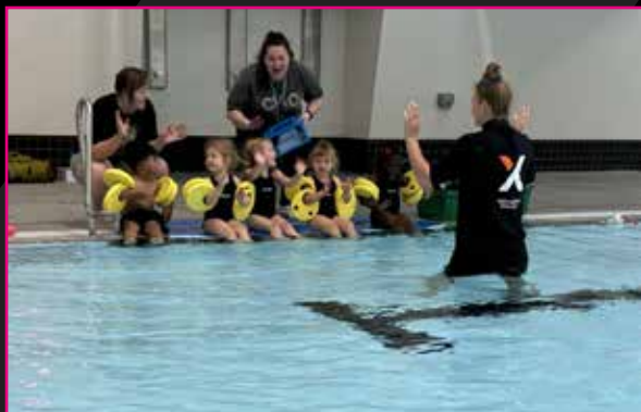
ABERDEEN SPORTS VILLAGE