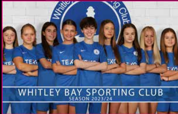
WHITLEY BAY SPORTING CLUB