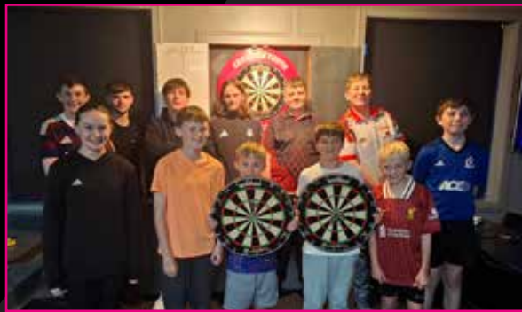
GRAMPIAN YOUTH DARTS TEAM