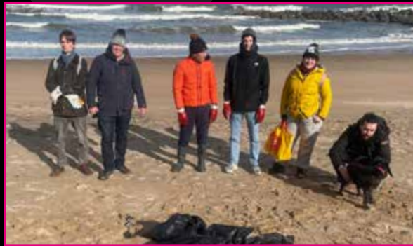
GREAT BRITISH BEACH CLEAN!