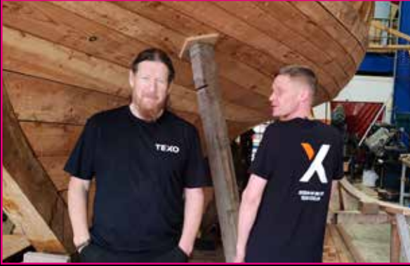
BLYTH TALL SHIP