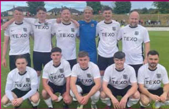
CAIRDY THISTLE AFC